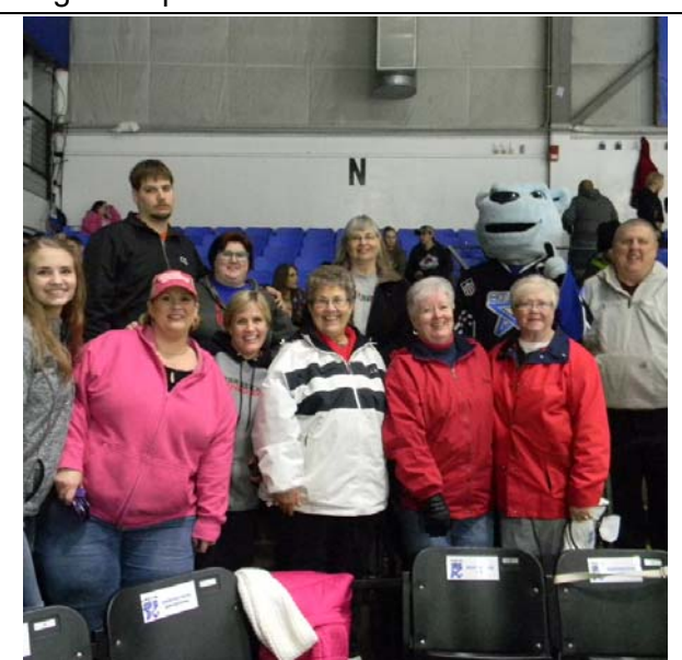
Part of Our Group with the Stars' Mascot

All GRs survived their ordeal to tell the tale. Our seats were right next to the opening laser and smoke show introducing the Stars. A veteran returning from Iraq and Afghanistan was honored on the ice before the game. It was "Mascot Night" and we witnessed a fun game of hockey between many local mascots at a break in the action. We even got our photo taken with the Stars' mascot.